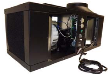
High ambient option