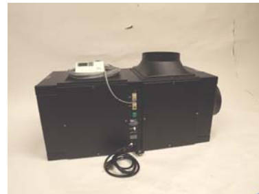
Low ambient option