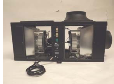
Electric heat option