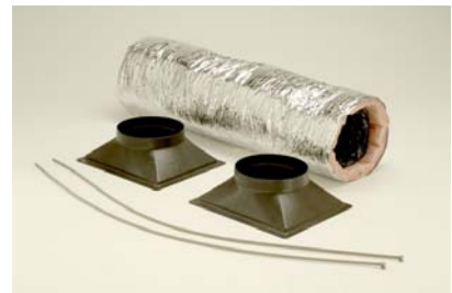
Duct collar kits