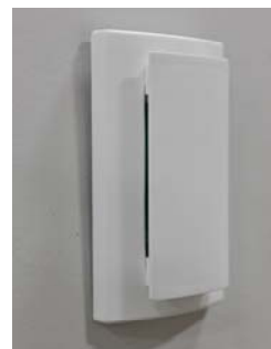
Remote temperature and humidity sensor