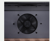
AIR CIRCULATION FAN