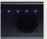
BLUE LED LIGHTING