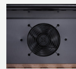
AIR CIRCULATION FAN