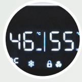
ELECTRONIC CONTROL TACTILE ON THE DOOR