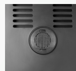
ACTIVATED CHARCOAL FILTER