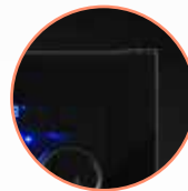
FULL GLASS DOOR

* Capacities are approximate and calculated with bordeaux bottles type.