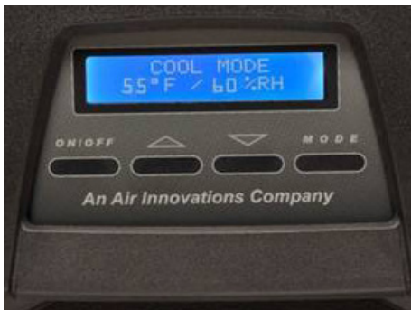
Front Digital Display