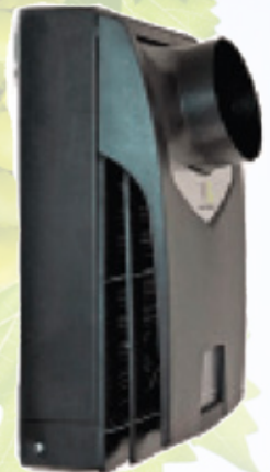
Back View With Optional Duct Adapter